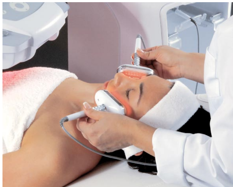
Silhouet-Tone offers a two-day training program to help you get started with its light-based devices.

Roundy introduced her LED system by incor-