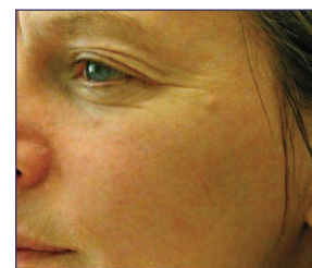
12 weeks after combination Omnilux Revive and Omnilux Plus treatments